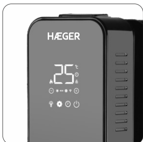
LED display & digital touch panel

11 Finos (550 x 120mm) 11 Elementos (550 x 120mm) 11 Ailettes (550 x 120mm)