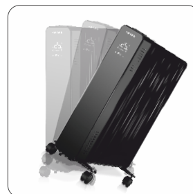
Safety tip over switch