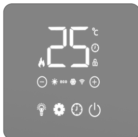
24 Hour Timer, Eco, Confort and Anti-frost Mode, Child lock