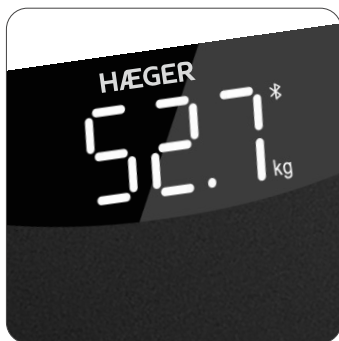
Large LED Display

Capacidade: 180kg (396lb) Capacidad: 180kg (396lb) Capacité: 180kg (396lb)