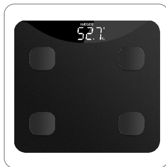
4 highly sensitive electrodes